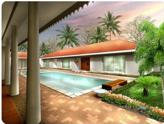
Original Architect Vision

In order to help you visualize your project with our products (Colorroof and Elabana roof tiles), MONIER has developed a simulation software to help you decide which color and shape best matches your project. With it, we simulate how the roof can look with different MONIER tiles and colors. It helped many customers to select the right roof for their project