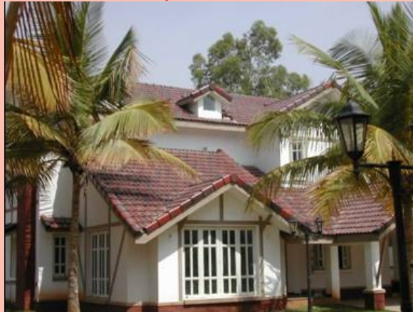
One of the 203 English-style villas, at Samarpan

A 203 villa project with Antique Red Elabana tiles has just been completed in Bangalore.