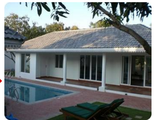
Finished Project with Antique Grey Elabana tile

Send us the picture of your project to get a roof visualization free of cost at: Contact.India@monier.com