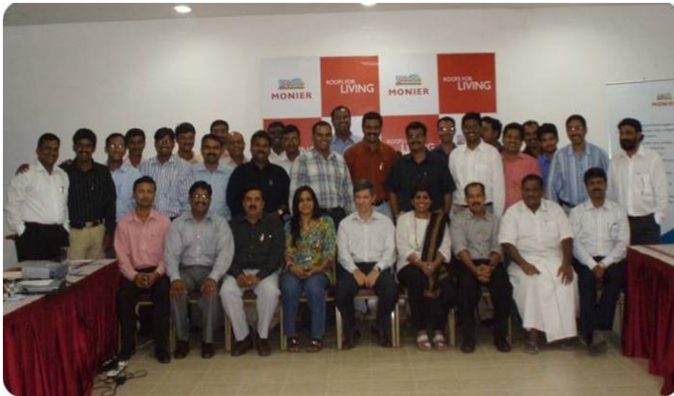
The MONIER sales team along with its dealers

To launch its new name in India, MONIER gathered together all its Indian dealers (Roofing Partners) in Mahabalipuram (South of Chennai). This two-day convention was an opportunity to remind them the priorities for 2008, the key advantages of MONIER products and to reward our best 2007 sales performer. Shanmungan & Co. , of Coimbatore was awarded as the best sales performer of 2007.