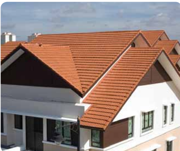
Coloroof Plus - from Monier

Monier India is committed to the protection of the environment. We continuously benchmark the environmental performance of our operations and supply chain processes to minimize any harmful effect to the environment from our activities. Monier India's commitments in this respect covers a more efficient use of energy and natural resources, minimization of waste production, reducing harmful air emissions and waste water recycling. Monier India employees actively participated in the World Environment Day activities and planted trees in the Monier Bangalore factory premises.