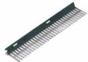
Eaves filler comb