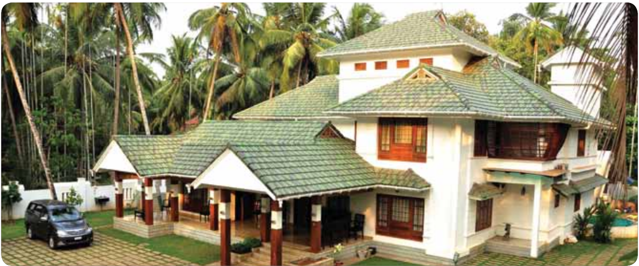
Elabana – Antique Green from Monier

Monier India has developed CoolRoof® system that shields houses from the sun's heat and reduces the heat inside.